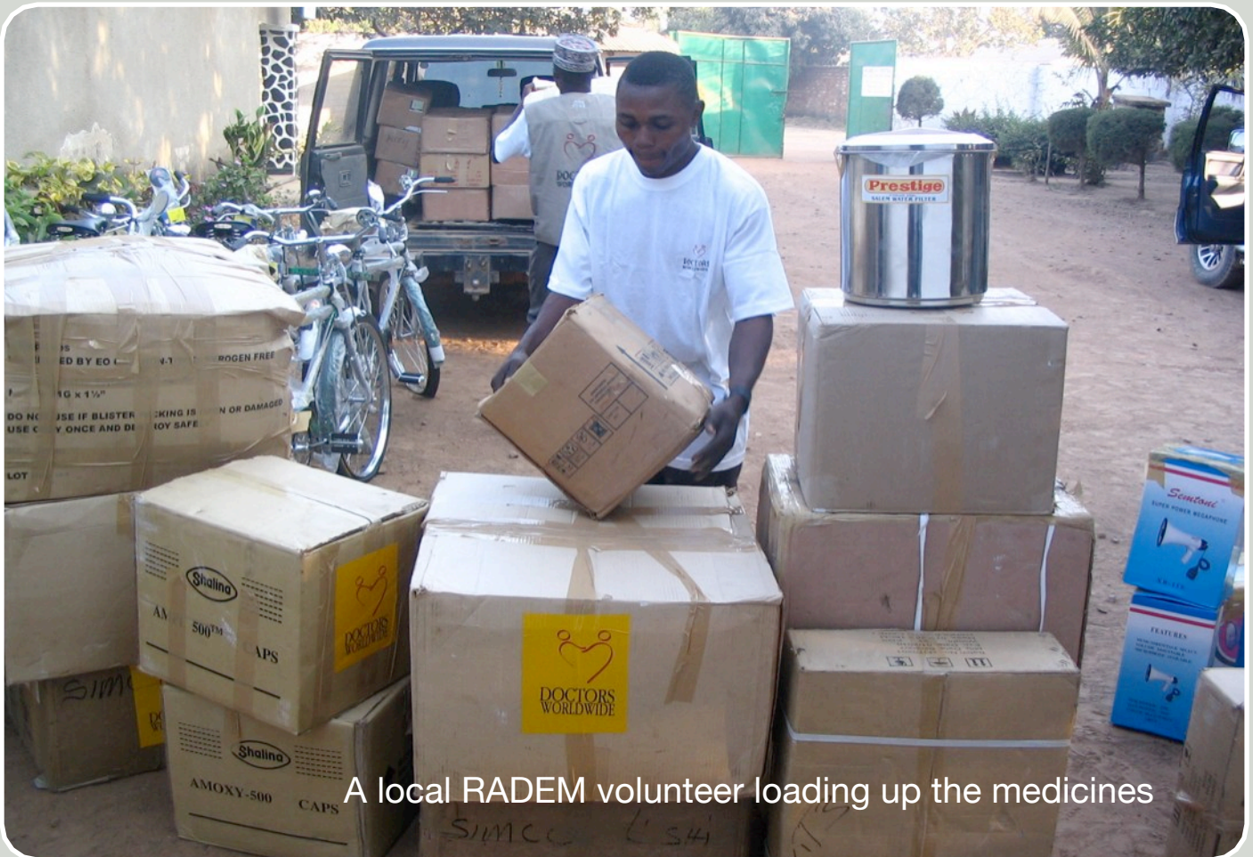
A local RADEM volunteer loading up the medicines

The quarterly newsletter from Doctors Worldwide - Summer 2007