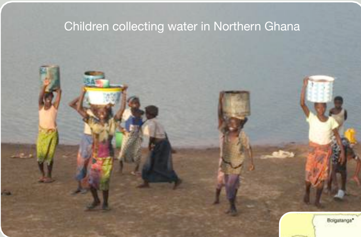
Children collecting water in Northern Ghana

The quarterly newsletter from Doctors Worldwide - Autumn 2007